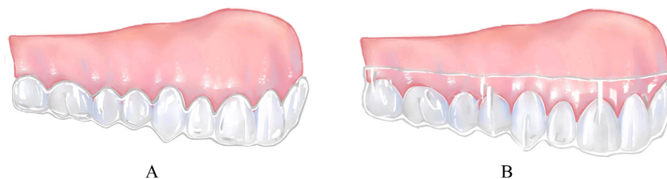
Fig. 1 – Two main gingival margin design features of clear aligners. A, The gingival margin of the aligner is designed as scalloped. B, The gingival margin of the aligner is designed as straight 2 mm up the gingival zenith.

materials, clear aligners have become more flexible, adaptive to the dental arch, and constant in orthodontic force. 17 Over the last 20 years, thermoplastic removable appliances have evolved, and clear aligner treatment techniques have been refined. With the help of extra tools such as mini-screws, elastics, sectional wires, and rapid palatal expanders, 18-22 clear aligners can now be used for more than just simple cases. 15,16