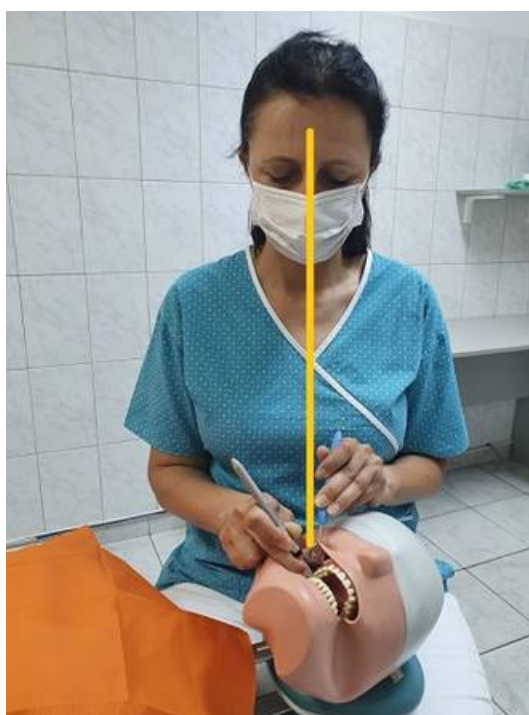
Figure 6. The median of the dentist's body at 11 o'clock and head rotation to left.

Starting from a “neutral” position of the head on the headrest, in which case the patient looks directly at the ceiling, the doctor may ask the patient to make a series of movements to orient the working surface under their gaze, thus not having to change their balanced posture. The doctor will not be able to work unless their gaze is pointed directly on the working surface, and they will always look for this relationship. The movements that can be performed by the patient's head are as follows: left or right rotation, flexion or extension of the