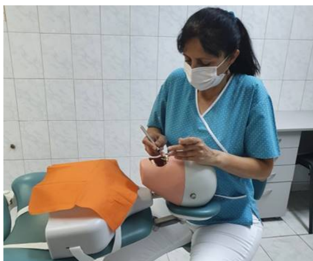
Figure 3. Short working distance.

A short working distance may be generated by the patient's head position being too high (above the doctor's xiphoid appendix) or, in the case of a correct positioning of the patient's head at the level of the xiphoid appendix, the doctor's excessive bending to approach the work field (bending the head and/or rounding the back), usually when they do not properly see the details of the operating field because of myopia. When the patient's head has been positioned too high, a series of negative consequences appear: raising the doctor's shoulders, insufficient space for handling the instruments, increased risk of contamination of the doctor and poor focus of the gaze (Figure 3).