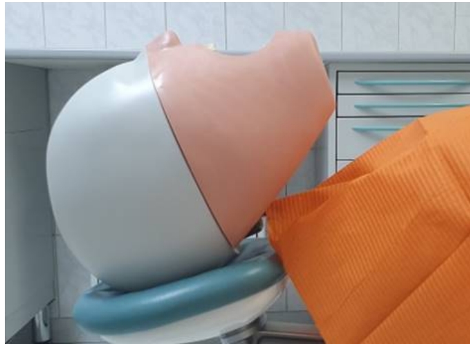
Figure 9. Patient's head extension.