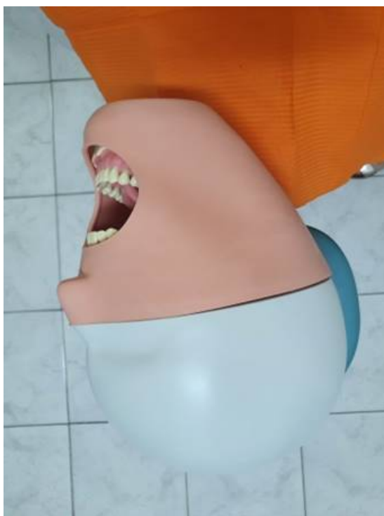
Figure 7. Patient's head rotation.

head and lateral flexion (lateral tilt) on the left or right (Figures 7–10). In daily practice, a combination of these movements is used, performed to different degrees. They are performed to a greater extent if the access and visibility are more difficult (especially for the distal areas). Rotation of the head is most often necessary, but there are situations that require extension of the head (e.g., working in indirect visibility on the occlusal surfaces to the upper jaw, Figure 11) or a slight flexion; sometimes lateral flexion corrects the orientation of the working field surface to be directly under the doctor's eye. Finally, the headrest is adjusted to support the patient's head in the chosen position.