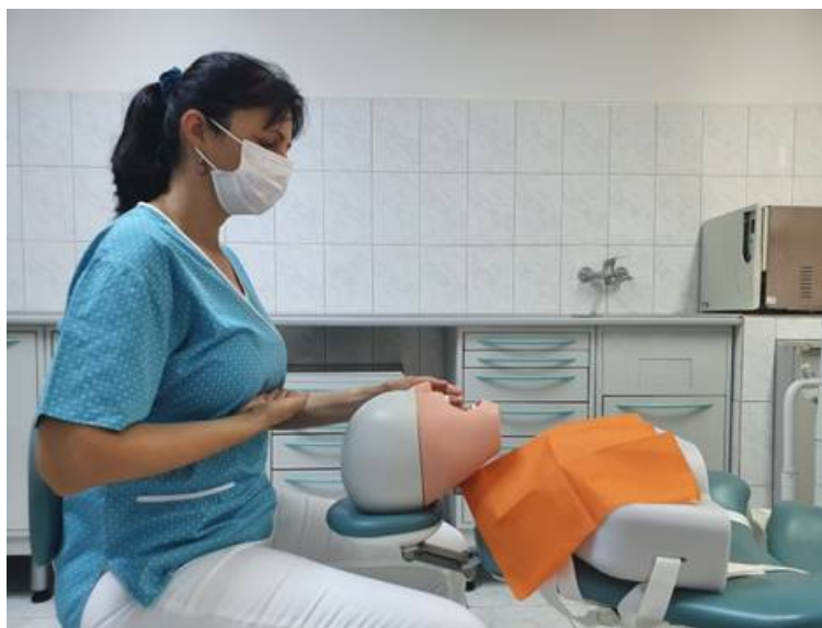
Figure 2. The optimal working distance.

the hands. Thus, the optimal working distance is obtained after positioning the doctor in a balanced position by bringing the patient's head to the level of the xiphoid appendix (Figure 2).