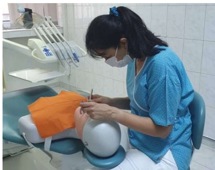
Figure 4. Increased working distance.

An increased working distance occurs when the patient's head is positioned too low (below the doctor's xiphoid appendix), and this will cause the doctor's head to bend for visibility, and/or rounding of the back (Figure 4). Additionally, the onset of presbyopia, usually after the age of 40, causes the doctor to increase the working distance by lowering the patient's dental chair for a clearer view. Optical correction will allow for obtaining an optimal working distance.