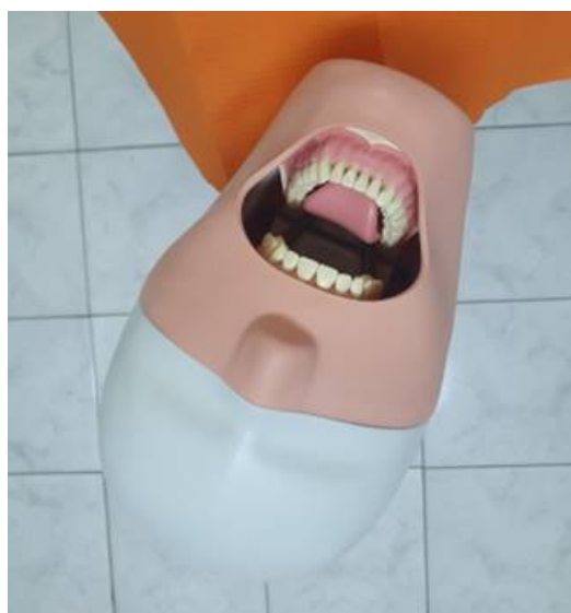
Figure 8. Patient's head lateral flexion.