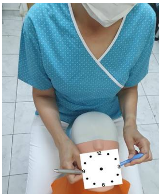
Figure 5. The clock superimposed on the patient's figure.