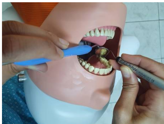
Figure 11. Indirect visibility and extension of the head.