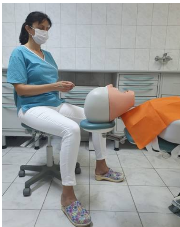
Figure 1. The balanced posture.