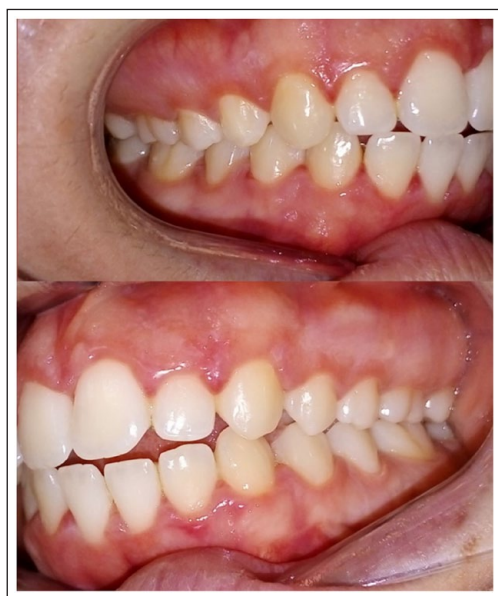
Figure 2. Initial clinical condition of the patient in lateral view.

In particular, cyclosporine induced gingival overgrowth affects 25%–81% of patients and usually occurs within 6 months of starting treatment. 5,6 Another problem is the high recurrence rate of this condition. 6 Although numerous studies have been performed, the etiopathogenetic mechanisms underlying drug-induced gingival hyperplasia are still unclear. 7 Some studies have shown an increase in the proliferation of gingival fibroblasts and keratinocytes, an over-regulation of some salivary inflammatory cytokines including interleukin (IL) -1 \alpha , IL-6, and IL-8, and an increase in cellular apoptotic processes. 1,5 Furthermore, chronic irritative factors including tartar and dental plaque are determinants in the most severe and massive pictures of drug-induced gingival hyperplasia. 8 DIGO therapy is controversial and, in fact, there are no studies in the literature that highlight a well-defined therapeutic protocol. In