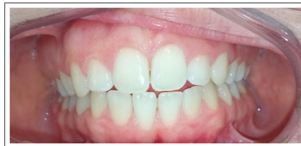
Figure 5. Clinical condition after photodynamic therapy in frontal view.

The patient improved markedly after only one cycle of PDT. There was an absence of clinically-detectable inflammation, edema, and rubor of the involved dental papillae (Figures 5 and 6). At the 4, 6, and 12 week follow-ups there were no recurrences. A noteworthy aspect is that the patient was not subjected to any oral hygiene practices in the outpatient setting and therefore the therapeutic effects are entirely attributable to PDT.