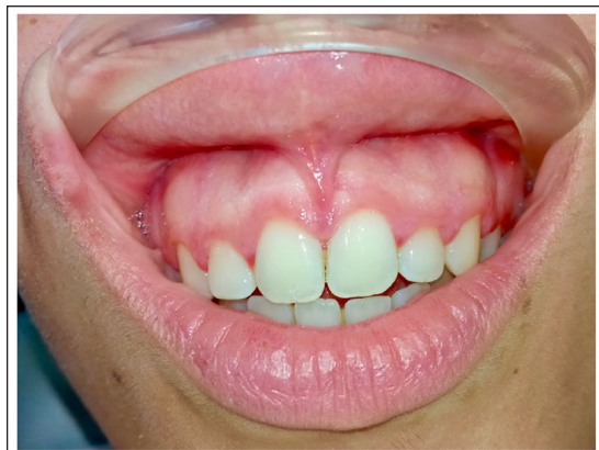
Figure 1. Initial clinical condition of the patient in frontal view.

In particular, cyclosporine induced gingival overgrowth affects 25%–81% of patients and usually occurs within 6 months of starting treatment. 5,6 Another problem is the high recurrence rate of this condition. 6 Although numerous studies have been performed, the etiopathogenetic mechanisms underlying drug-induced gingival hyperplasia are still unclear. 7 Some studies have shown an increase in the proliferation of gingival fibroblasts and keratinocytes, an over-regulation of some salivary inflammatory cytokines including interleukin (IL) -1 \alpha , IL-6, and IL-8, and an increase in cellular apoptotic processes. 1,5 Furthermore, chronic irritative factors including tartar and dental plaque are determinants in the most severe and massive pictures of drug-induced gingival hyperplasia. 8 DIGO therapy is controversial and, in fact, there are no studies in the literature that highlight a well-defined therapeutic protocol. In