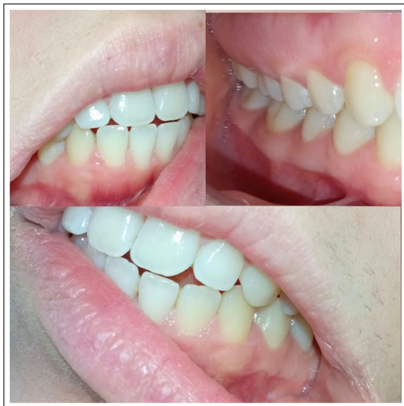
Figure 6. Clinical condition after photodynamic therapy in lateral view.