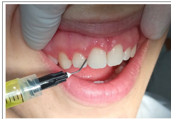
Figure 3. Application of the photosensitizer.