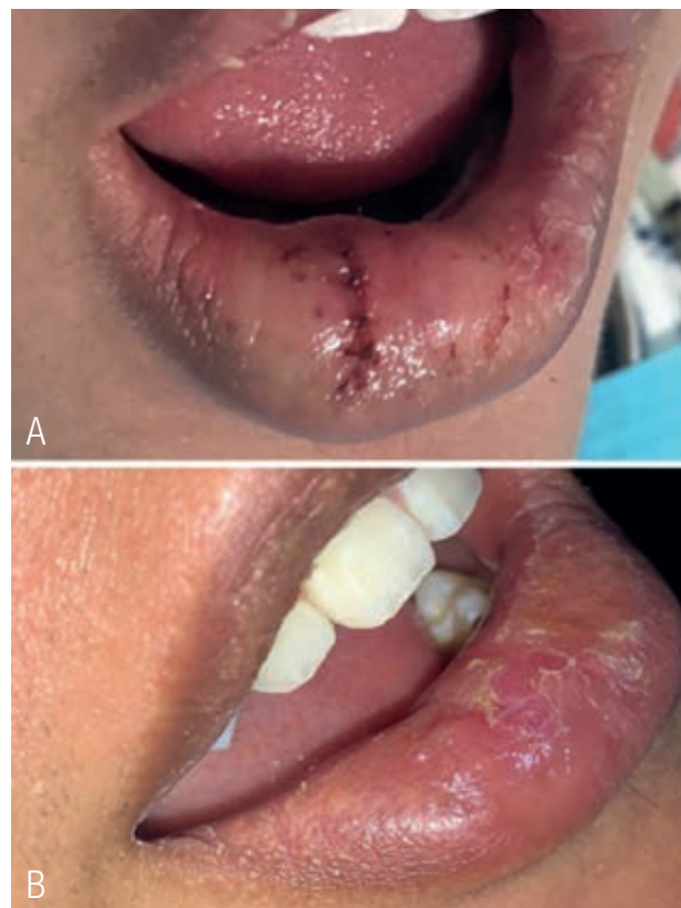
Figure 2. A. Biopsy of the lesion. B. Clinical control at eight days, with good wound healing, rest of the vermilion dry and with scaly areas.

Menarini Group, Spain) was prescribed, one tablet every 8 hours for 3 days, apply Oddent® Periodontal gel (chlorhexidine digluconate 0.20%; Menarini Group, Spain) on the surface 3 times a day, for 5 days. At the 8-day control, he shows very significant healing of the area (Figure 2.B).