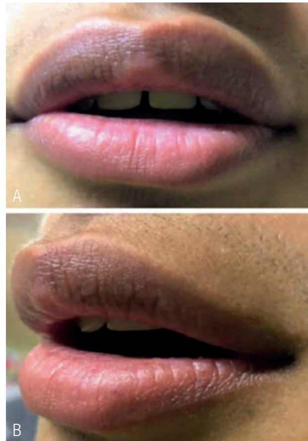
Figure 6. Control after one and a half months, vermillion is observed on both lips moisturized, without the presence of scales and the fissures are less pronounced.

The follow up after a month and a half, shows a noticeable improvement (Figure 6), both visually and to the touch of the vermillion on both lips, he has opted for a behavioral therapy that has helped him in managing depression and anxiety episodes.