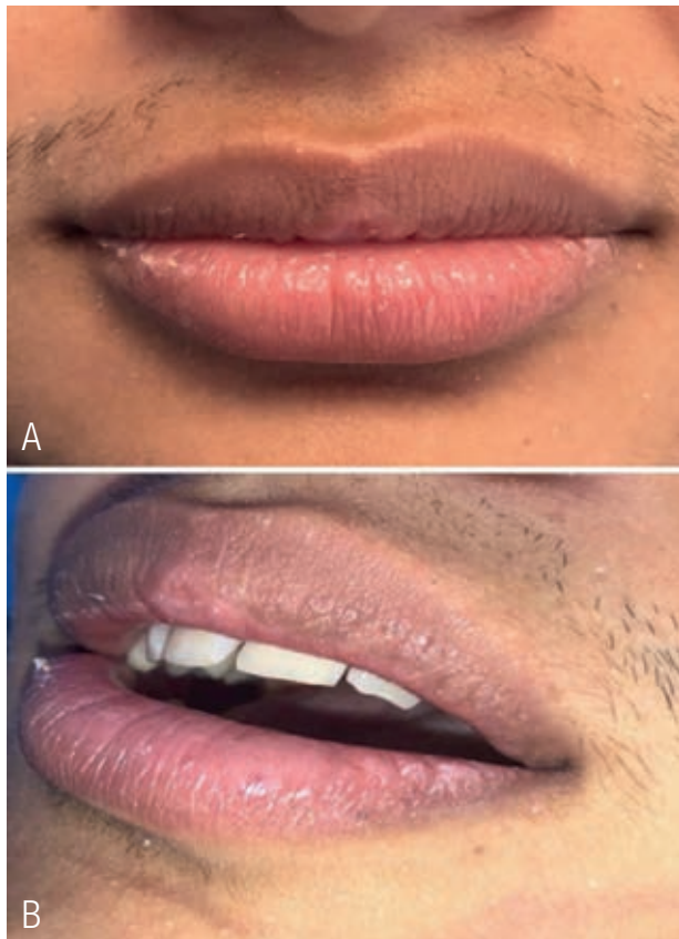
Figure 5. A. Dry, fissured lower vermillion with scaly areas. B. Superior vermillion with coastline at the level of the midline and rest of the dividing line with dry and tight labial mucosa.

areas, a line that divides the vermillion and the resected upper labial mucosa at the midline level (Figure 5). Both lips tend to tear it off with his teeth especially when stressed, also because it looks unpleasant and bothers him when he speaks, sometimes it even breaks and hurts when opening his mouth or eating. The perioral skin is dry, with slight scaling and some erythematous areas. No palpable lymph nodes were found at the neck level.