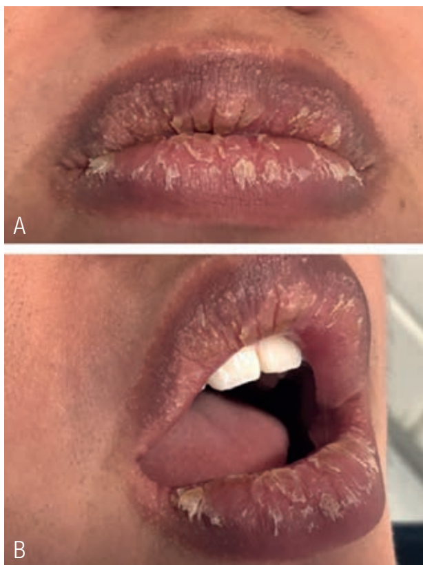
Figure 1. Vermilion covered by thick, adherent yellowish-white scales, some of which are large, but when detached, normal-appearing tissue of the lip is evidenced.

He is consulted and reports that he suffers constipation and that his hydration is poor, although he has lately been drinking flavored water without sugar. Laboratory tests were prescribed: complete blood count, clotting times, serum levels of vitamin B12, folic acid, iron, ferritin and IgE; being hemoglobin 13.8 (14-18) g/dL, hematocrit 40.1% (42-52) and the other results within the norm.