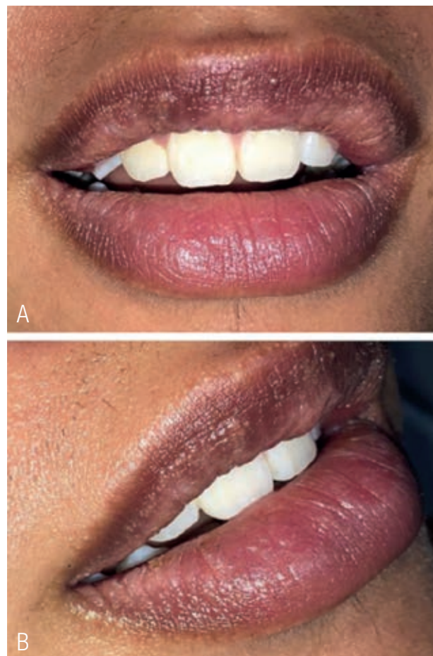
Figure 4. After 3 months, both vermilions are moisturized and show reduced scaly areas.

the application of vitamin E every 8 hours has not met the schedule, using lip balm is more practical.