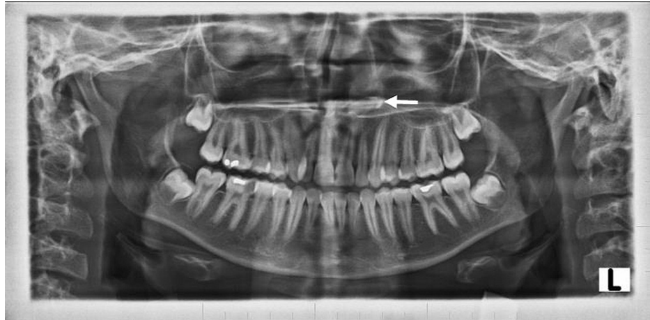
FIGURE 5: Orthopantomogram showing tooth-like radiopaque structure (white arrow); a shape resembling a canine with a relatively smaller size. The radiodensity of this radiopaque structure resembles enamel, dentin, the pulp chamber and the pulp canal in relation to the left nasal floor.