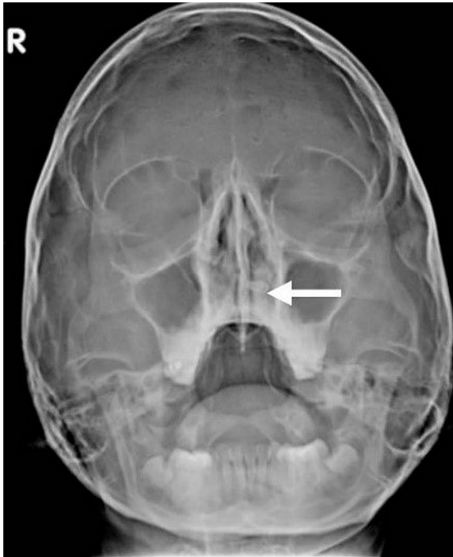
FIGURE 1: Plain x-ray shows the radiopaque structure in the left nasal cavity, embedded in the hard palate (white arrow).

The CT scan of paranasal sinuses showed a tooth-like bony structure with a pulp cavity in the hard palate extending into the left inferior nasal cavity and a deviated nasal septum with convexity to the left (Figures 2-4); a shape resembling a canine with a relatively smaller size.