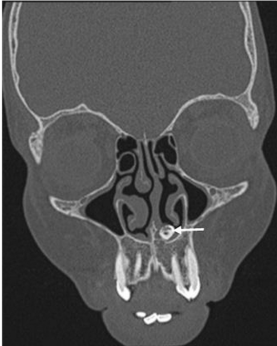
FIGURE 3: Coronal image showing a bone-like structure (white arrow) embedded in the hard palate extending into the left nasal cavity.