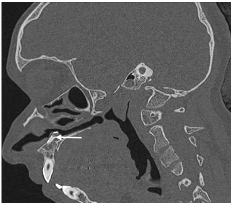
FIGURE 2: Sagittal image showing complete extension of an intranasal tooth (white arrow), which is embedded in the hard palate.