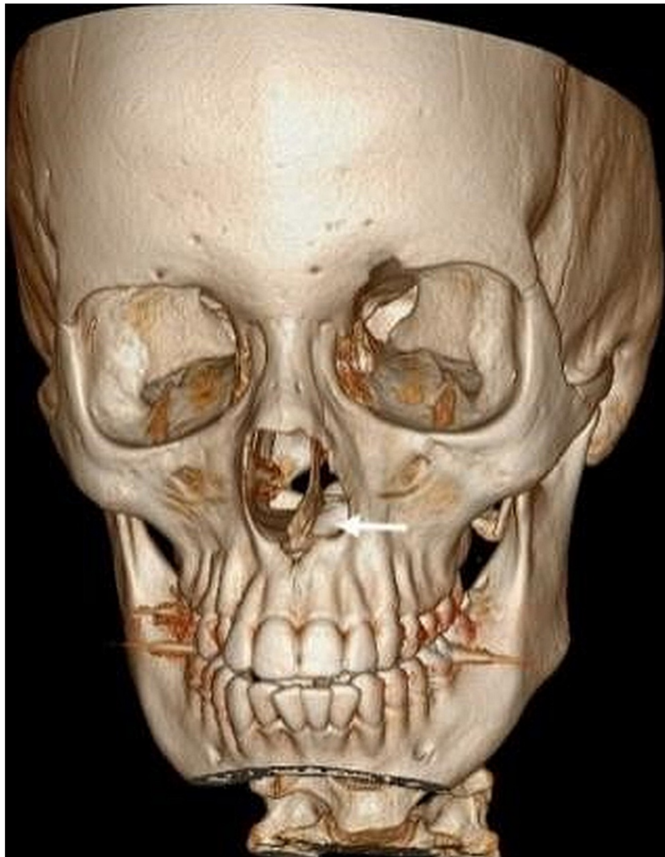
FIGURE 6: Reconstructed 3D CT image showing tooth-like structure in the left nasal cavity (white arrow) embedded in the hard palate.

3D CT - Three-dimensional computed tomography scan