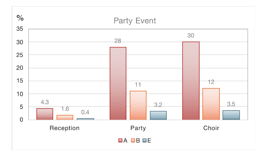
Figure 2. Individual risk of a particular person being infected (equivalent to the percentage of the group being infected), comparing a party with a reception and a choir practice, for three scenarios. Scenario A: passive ventilation, no masks. Scenario B: active ventilation with outside air, no masks. Scenario E: High-volume filtration with HEPA.