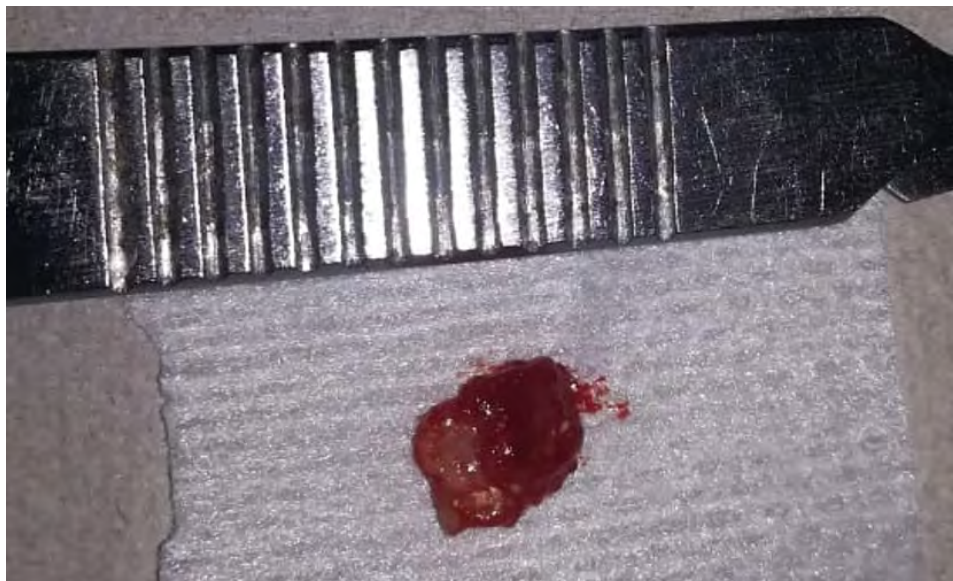
Figure 3. Macroscopic view of the resected specimen