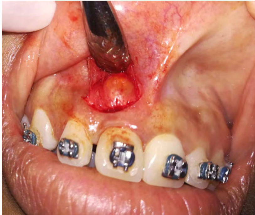
Figure 2. Lesion exposure

of vascular light and an infiltrate with significant infiltration of eosinophils. The definitive anatomopathological report was "angiolymphoid hyperplasia with eosinophilia".