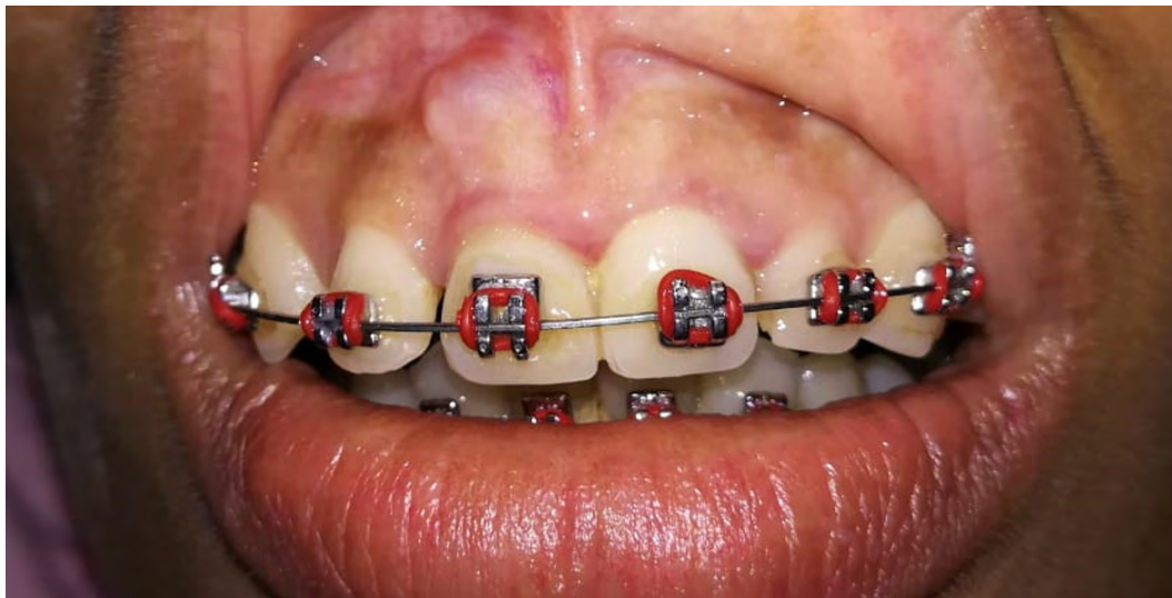
Figure 1. Clinical view of free gingiva lesion on top right quadrant

The intraoral examination showed a nodular lesion located at the level of free gingiva of the right upper central incisor, of the same color of adjacent mucosa with a violet central region, which was maintained despite the increase in size. The lesion was approximately 1 cm in diameter, asymptomatic to palpation, of fluctuating consistency, with liquid content, 4 months of evolution, and unknown etiology. Clinically, the lesion did not coincide with infectious processes, and the images showed no bone compromise. The patient had had bimaxillary orthodontic appliance for about 1 year, which was still active (Figure 1).